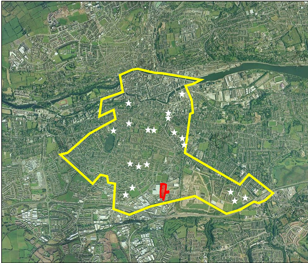
Figure 3. Locations of 19 no. existing early years childcare services within the defined catchment area of the proposed Creamfields SHD site (generally indicated in red). (Sources: Ordnance Survey Ireland and TUSLA; Annotated by Coakley O'Neill Town Planning Ltd., 2022).